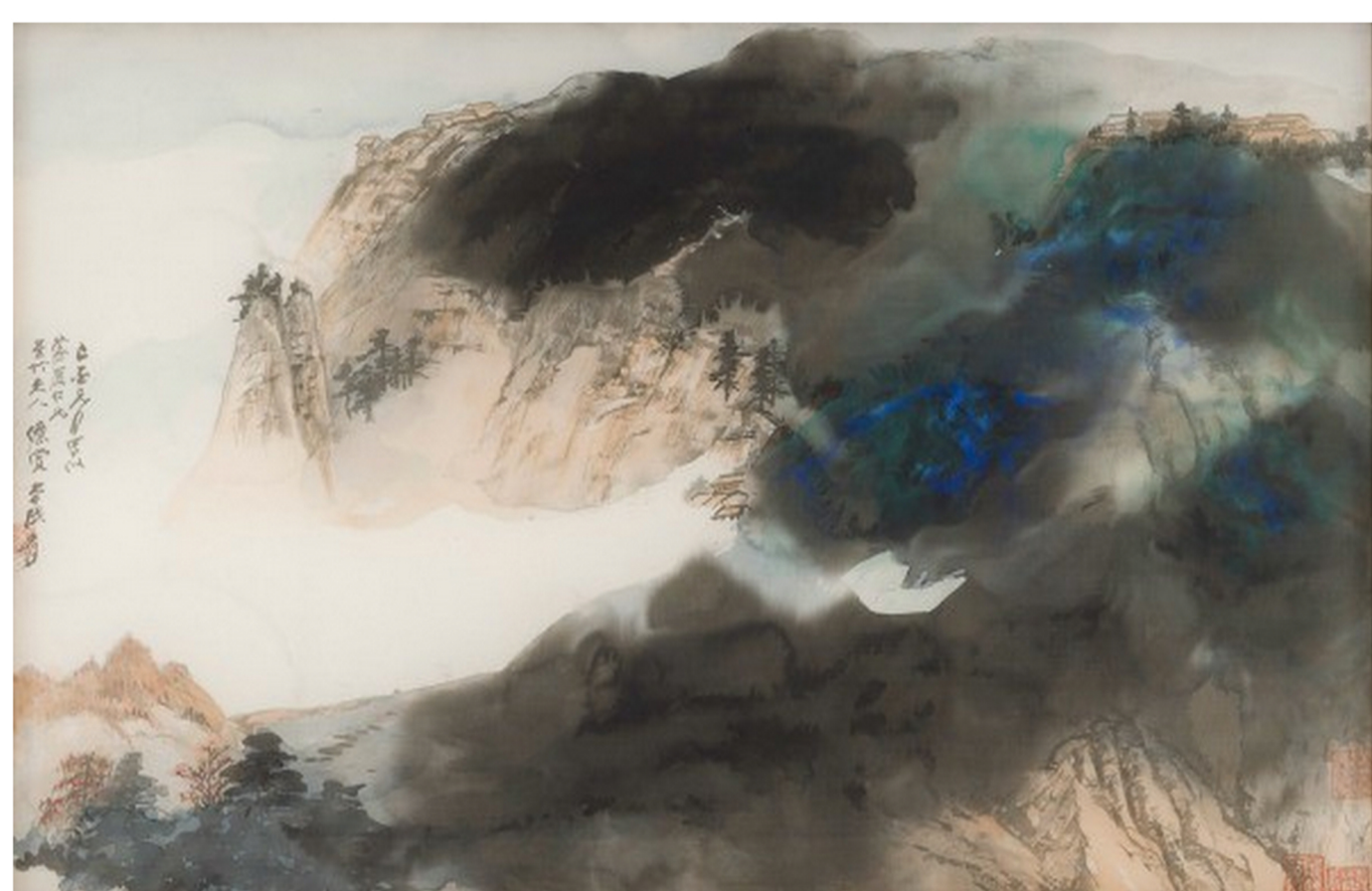
Asia Week San Francisco Bay Area

Some highlights include a symposium series from the Asia Society Northern California , a Chinatown Art Walk by the Chinese Culture Foundation of San Francisco , and rare Himalayan art from The Mongolia Foundation .