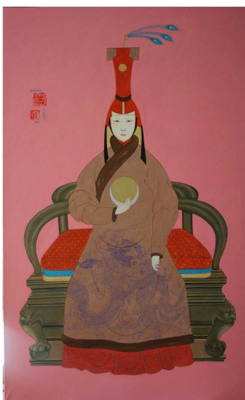
Asia Week San Francisco Bay Area